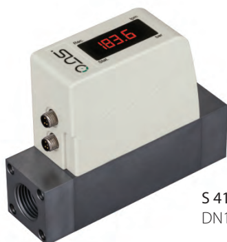
S 415 as DN8 or DN15 version