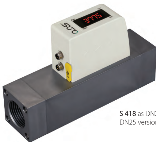
S 418 as DN20 or DN25 version

The SUTO S 415 and S 418 thermal mass flow meters offer gas flow and consumption measurement directly at the point of use. These highly economical units will help you improve system efficiency, while helping reduce compressed air usage and operating costs. Both versions come standard with Service App to help the user quickly and easily check the flow meter readings or adjust the settings via the SUTO flow meter App.