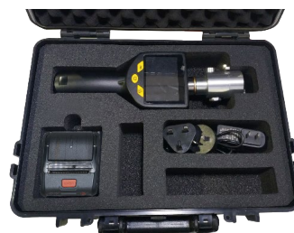
The included transport case protects the measurement instrument. At the same time it holds all accessories.