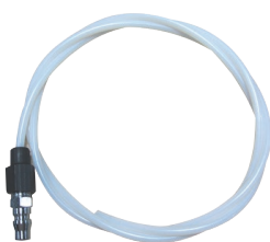
PTFE hose with quick connect