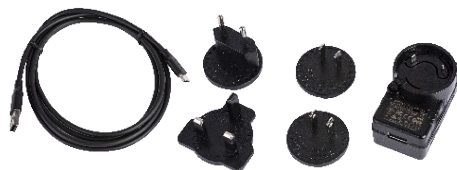
USB charger with USB-C cable