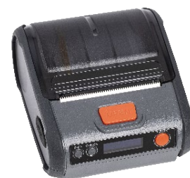
Option: wireless printer used to print the measurement results on site. Perfect solution for quick audits.