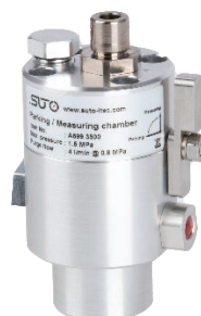
Unique measuring/parking chamber for fast sensor response