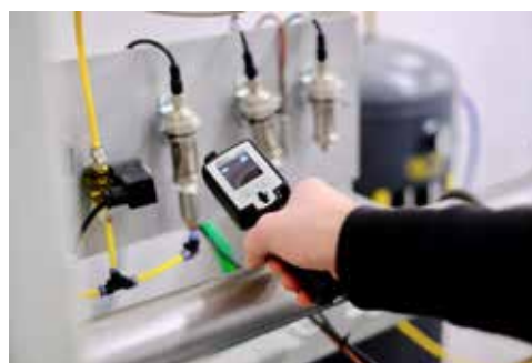
Ultrasonic Leak Detector S530