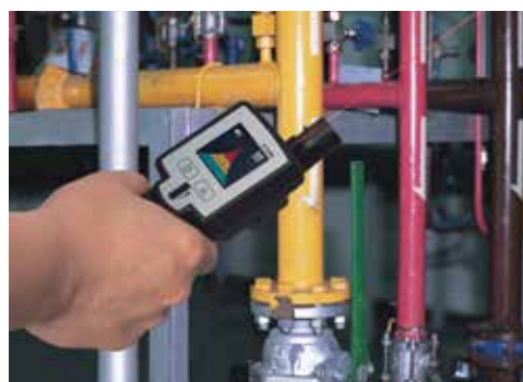
Leak detection from distance with the integrated laser pointer