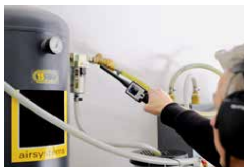
Leak detection with focus tube